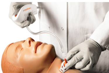
Ventrain with Cricath

Ventrain in combination with the transtracheal catheter Cricath® or endotracheal cuffed tube Tritube® re-establishes adequate oxygenation levels quickly as an I:E of 1:1 and a minute volume of respectively 7-7.5 L/Min can be obtained. Depending on the situation both can be used in difficult airway situations.