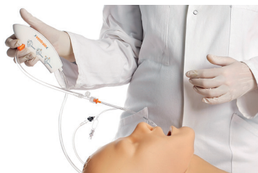
Ventrain with Tritube